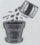
Seed planted in soil